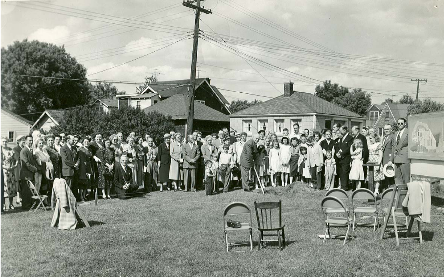
1952 groundbreaking for the present sanctuary