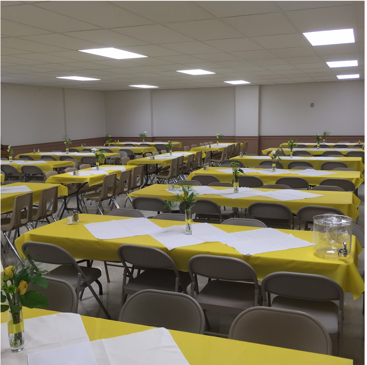
Newly renovated fellowship hall in 2016