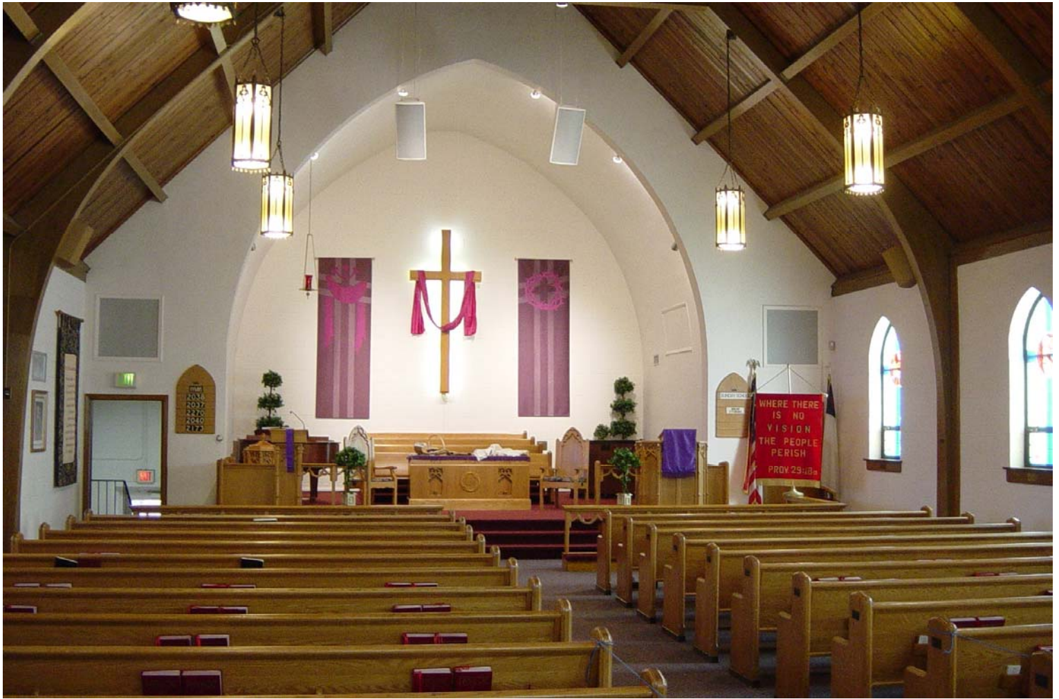
Our sanctuary in 2008

In 1991, chair lifts were installed to allow access to both the lower and upper levels of the building. The 1990's brought a new furnace and air conditioning, pew cushions, a new grand piano, and organ.