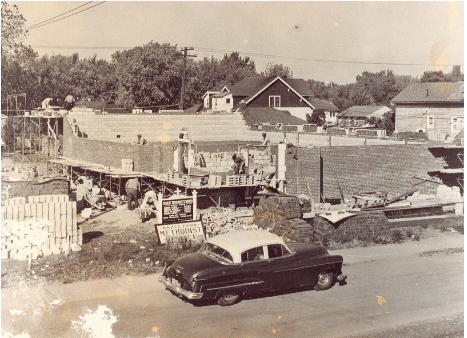
The new sanctuary begins to take shape