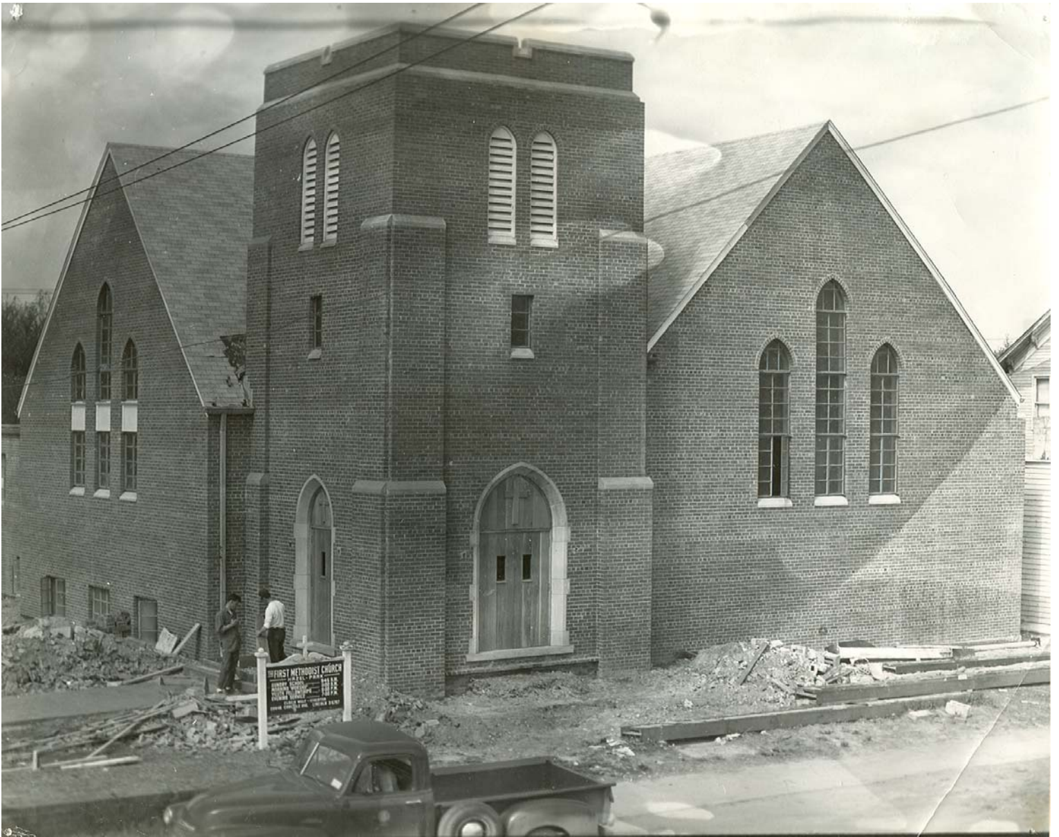
Construction nears completion in 1953