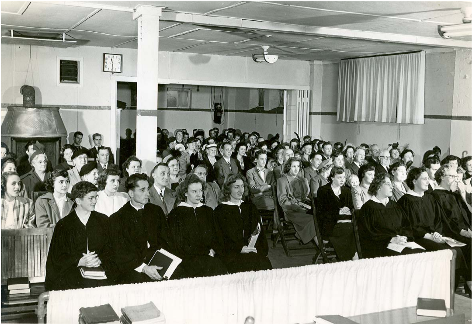
Services were held in the Basement Church from 1927-1952