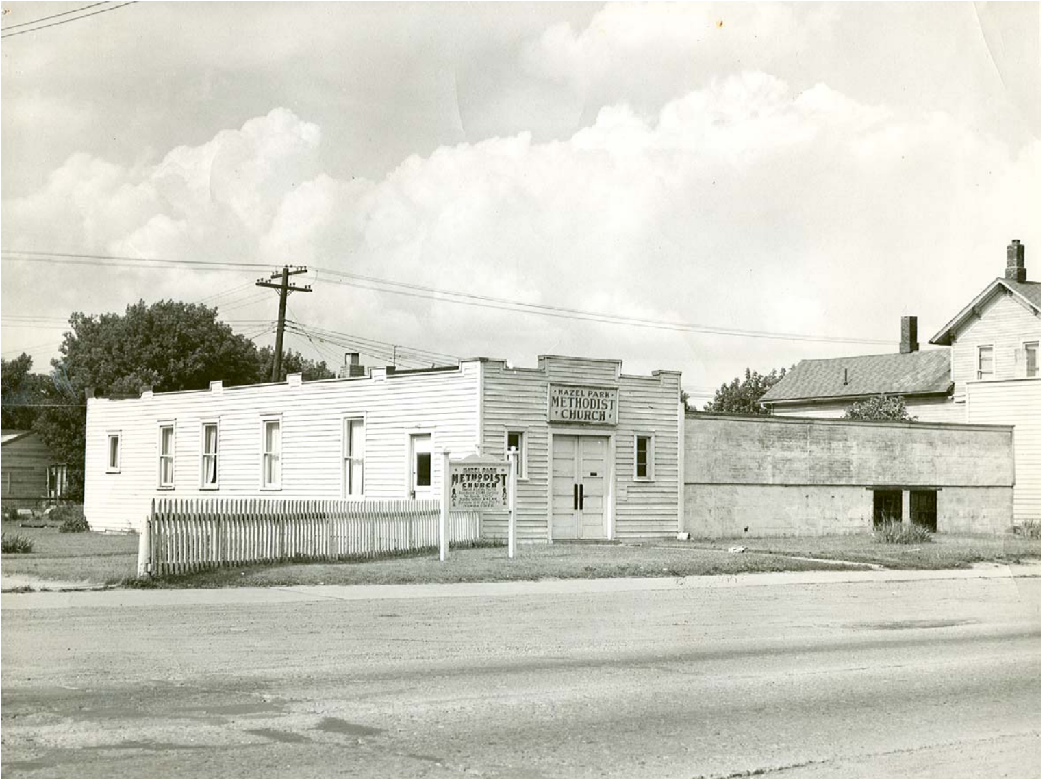
Exterior of the Basement Church

The First United Methodist Church of Hazel Park was established in November of 1924, as a Missionary project of the Royal Oak First Church. The first meeting was held in the Lacey School, and later moved to a feed store. One summer, the church used a tent for services. By 1926-27 a basement church, located on the property of the current church, was excavated, and would serve as the church meeting place for the next 25 years. The basement church started out with just 4 walls, but over time, improvements were made. Folding doors were installed to make a classroom (known for many years as Mrs. King's room); a furnace was installed; people donated dishes, towels, and kitchen utensils they could spare; and dinners were put on to raise money for hymn books, chairs, and other things that were needed.